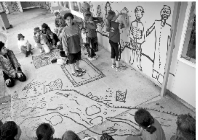
For the final day the children decided to make their mural in olden days. They are showing people sharing in the work of cooking and preparing food.

A highlight for me as the producer was all the positive comments from teaching staff about how it changed their school environment. We also invited the families to come and participate after school as a way of extending knowledge about the project into communities and so to widen the conversation around the themes. It was wonderful to see a packed courtyard at the BBQ on the final day. The outcomes for the school and their community have been very good, with positive press coverage, an article in the New Zealand School Journal , Maori and Somali families feeling valued for themselves, an exchange of knowledge between all the communities at the school and the individual children who took part all