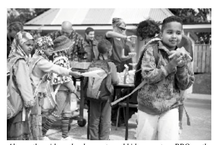
Above: the wider school parents and kids came to a BBQ on the last day.